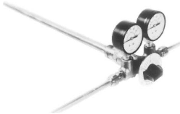
Figure 1. T61 Series Pneumatic Temperature Controller