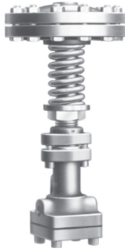
Figure 1. Type SP/P Safety Pilot