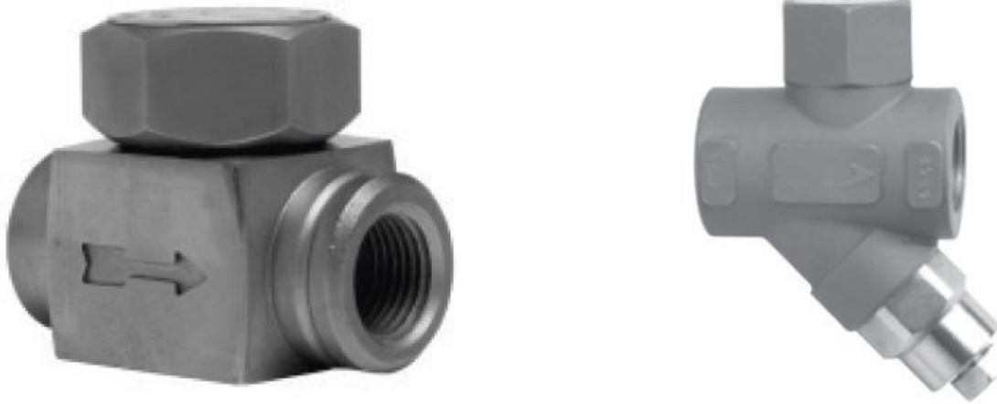
Figure 1. NTD600 Series Thermodynamic Steam Trap