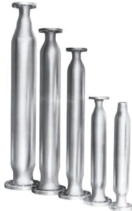
Figure 1. Noise Suppressor

The Noise Suppressor is designed to attenuate the noise generated by a pressure reducing station. These devices are particularly effective in limiting the propagation of valve-generated noise into the downstream piping. Being of the dissipative reactive type, they are effective over a broad frequency band (up to 12,000 Hz). Depending upon the flow and piping configuration, noise attenuation of up to 20 decibels is obtainable.