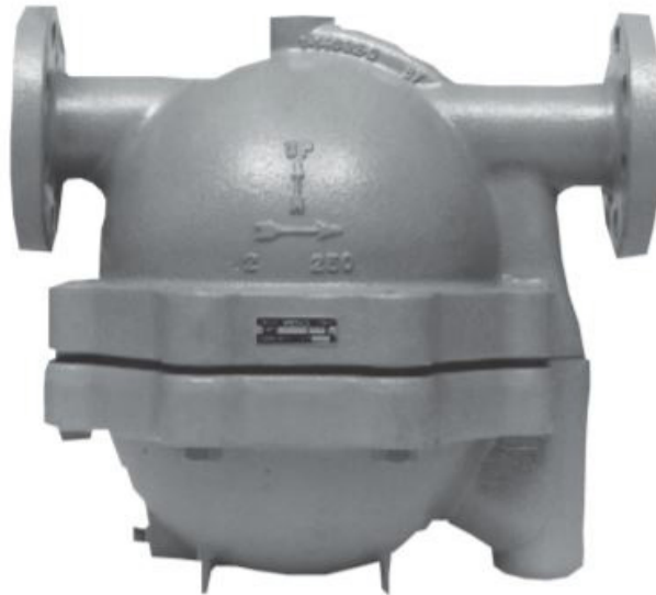
Figure 1. NFT650 Series Variable Orifice Steam Trap