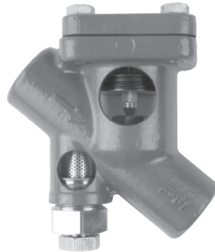
Figure 1. N650 Series Thermostatic Steam Traps

A steam trap is an automatic valve which discharges condensate, undesirable air and non-condensibles from a system while trapping, or holding in, steam. Thermostatic steam traps operate in direct response to the temperature within the trap.