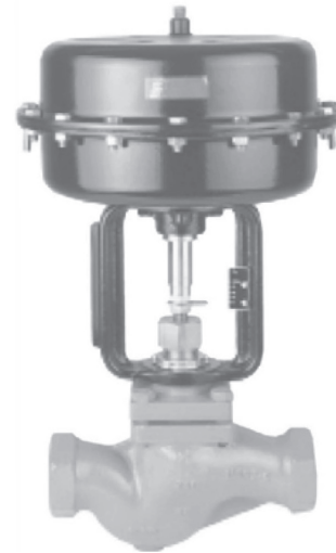
Figure 1. Type J Control Valve

This manual provides installation, operation and maintenance instructions for an air-operated switchover station using pneumatic control valves. Reference VCIMD-14934 for installation, operation, maintenance troubleshooting and parts ordering for Type J control valve.