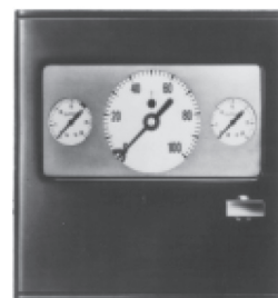
Figure 2. Type P60 Proportional Integral Controller