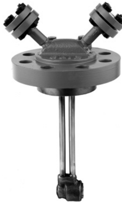
Figure 1. Air-Operated, Mechanical-Atomizing Desuperheater