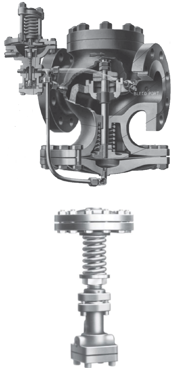
Figure 1. Type E Main Valve with Type D Pilot and Type SP/P Pressure Safety Pilot

Complete pressure regulator with safety pilot includes Type E Main Valve or Type D pilot and Type SP/P Safety Pilot.