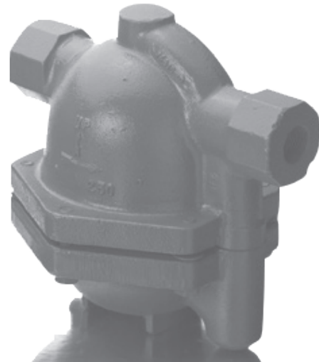
Figure 1. NFT250 Series Steam Trap

NFT250 Series are float and thermostatic steam traps. Float is free of levers, linkages or other mechanical connections. This float is weighted to maintain orientation and acts as the valve being free to modulate condensate through the seat ring. Air vent is balanced-pressure design with stainless steel welded