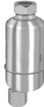
Figure 1. Type NLD Free-Floating Lever Drainer

This manual provides instructions for the installation, troubleshooting, maintenance and setting of Type NLD Free-Floating Lever Drainer.