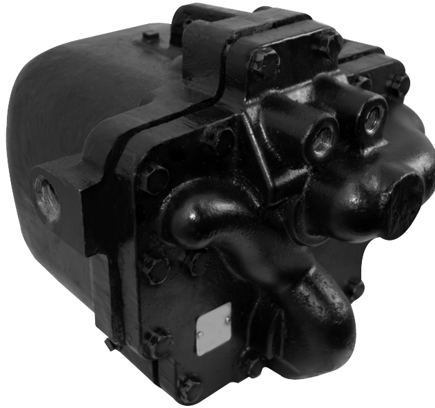
Figure 1. Condensate Recovery Pump Trap